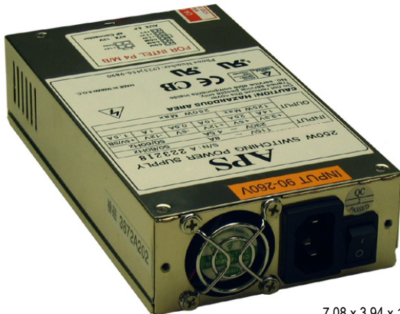
7.08 x 3.94 x 1.57" 180 x 100 x 40.5mm